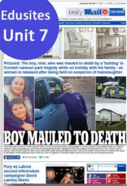
THE MAIL ONLINE