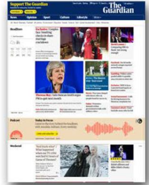
THE GUARDIAN ONLINE

How to use: Use this Knowledge Organiser to compare and contrast these newspaper websites. Highlight the similarities and differences.