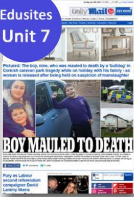
THE MAIL ONLINE