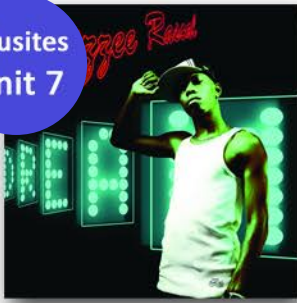
Dream , Dizze Rascal 2004